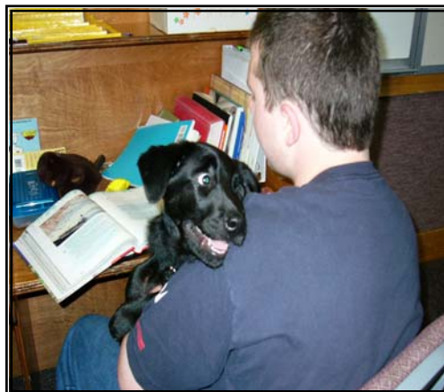
...when it comes to being read to!