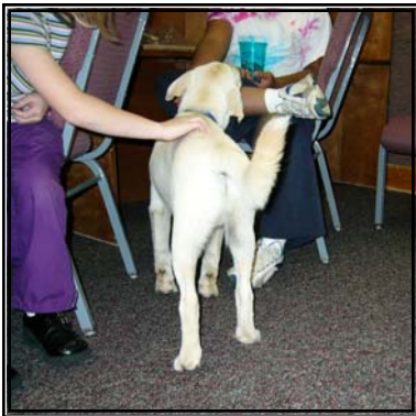
Bojangles brings happiness!