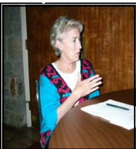
“They worked hard and did not give up,”