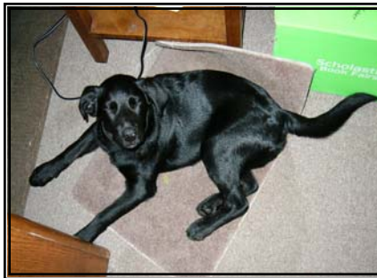
Munchkin, showing she's very much at home here at Grandfather Academy!

Our last question for our Director of Treatment Services regarded how she sees this program changing or growing.